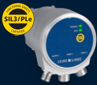
FSI 600 SERIES Safety for automation