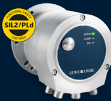
FSI 900 SERIES Independent safety system