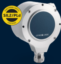
FSI 800 SERIES Safety for motors and drives