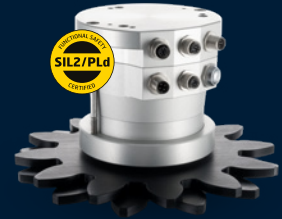
FSI 900 YAWMO Independent safety system